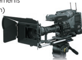
PDW-F800 with cinema lens