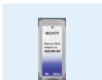
MEAD-MS01 Memory Stick Adaptor