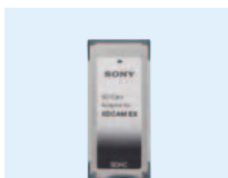
MEAD-SD01 SD Card Adaptor