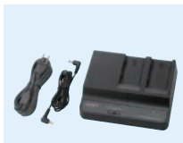
BC-U2 Battery Charger (2-slot)