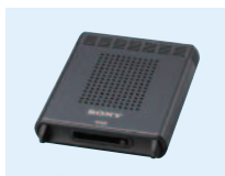
SBAC-US10 SxS Memory USB Reader/ Writer