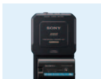
PHU-220R Professional Hard Disk Unit