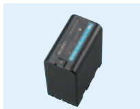
BP-U90/U60/U30 Li-Ion Battery Pack