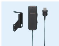
CBK-WA01 Wi-Fi Adaptor