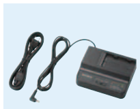
BC-U1 Battery Charger (1-slot)