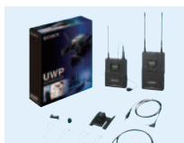
UWP-V1/V2 Wireless Microphone System