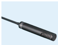
ECM-MS2 Stereo Microphone