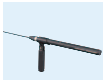
ECM-680S Stereo Microphone