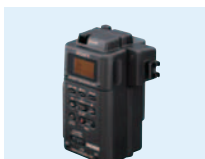
HVR-MRC1K Memory Recording Unit