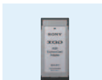
QDA-EX1 XQD Adaptor