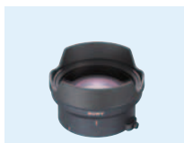
VCL-EX0877 Wide Conversion Lens