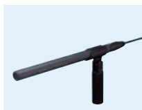
ECM-678/674/673 Monaural Microphone